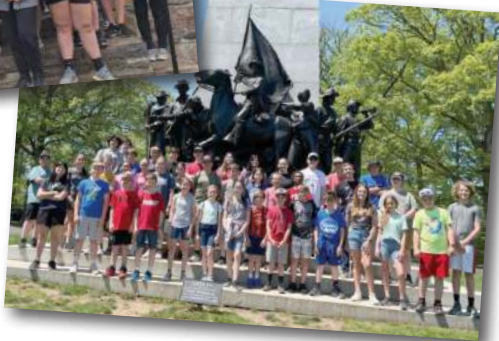
Our middle school students took a walk through history in Gettysburg.