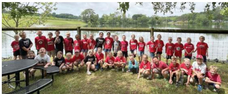
1st & 2nd grade had a terrific day at Lake Tobias!