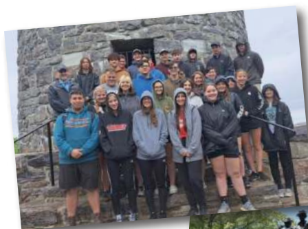
11th & 12th grade students explored the history of Antietam and Harper's Ferry!