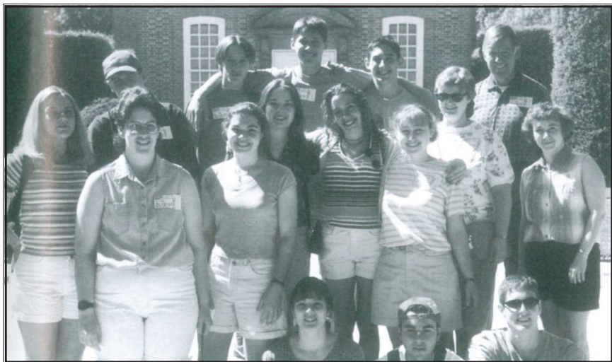
Senior Trip 1997

If your graduation year ended in '02 or '07, you've reached a milestone year and we would love to help you reminisce and celebrate! The Classes of 1962 and 1972 will be gathering during Homecoming weekend to commemorate their time at BMS more than 50 years ago, but you can plan a reunion at any time and are welcome to use our available facilities. Please call the school office (717-935-2184) if we can assist with contact information or help to coordinate a special time together!